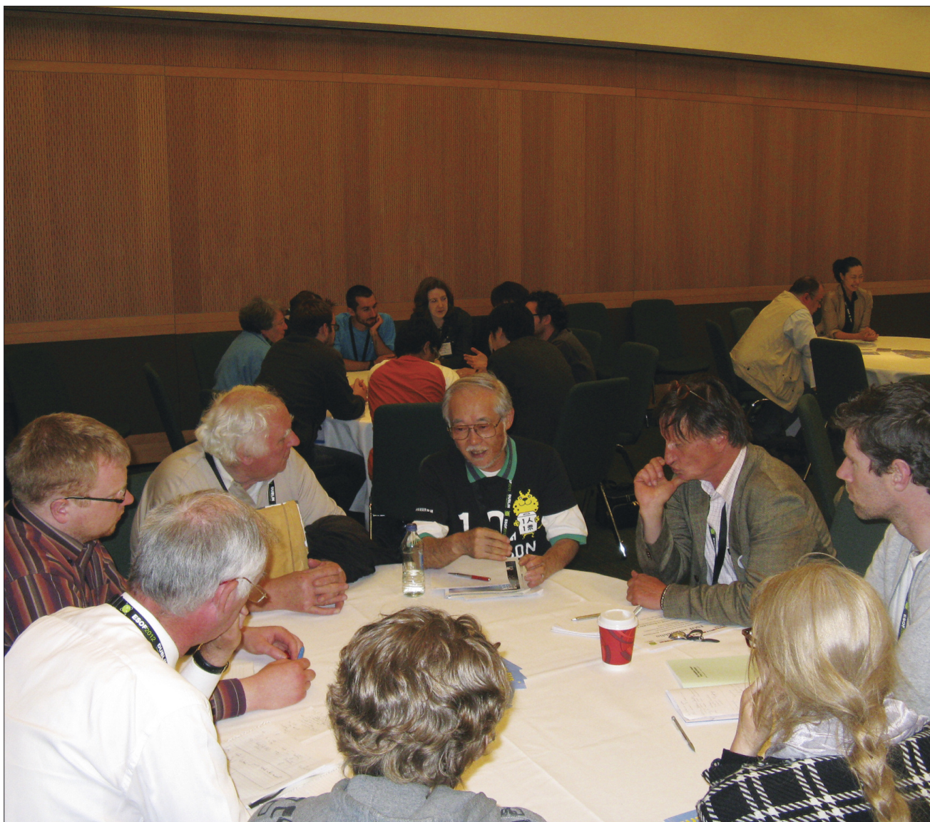
New interactive and participatory formats in science, technology and innovation: Roundtables during ESOF 2012 in Dublin on what will power Europe's future.

principal stakeholders for a live debate. Confirmed participants of research and industry are: