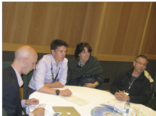
After the speeches at ESOF 2012, the audience discussed in small groups about an issue of choice concerning Energy, and each group was invited to express in a few words the results of the debate (left hand caption). Science Debate ESOF Dublin 2012 (right hand caption).