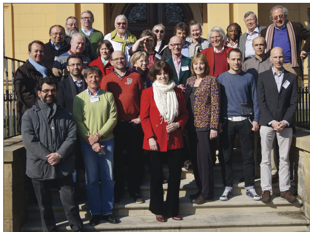
The EUSJA board and delegates at the General Assembly in Prague, March 2013.