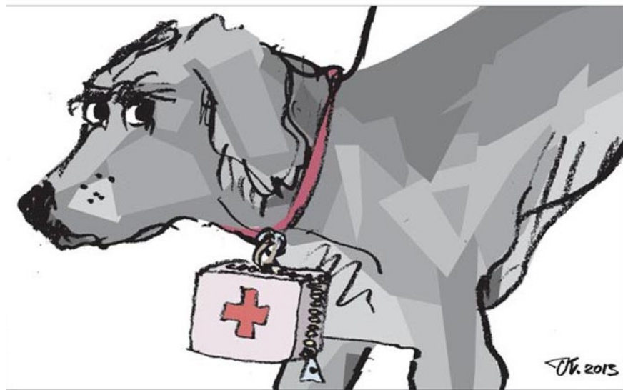
Our best friend

Animals make humans better persons. People who like animals are generally both kinder and healthier. And those who treat animals badly generally also have problems in their human relationships.