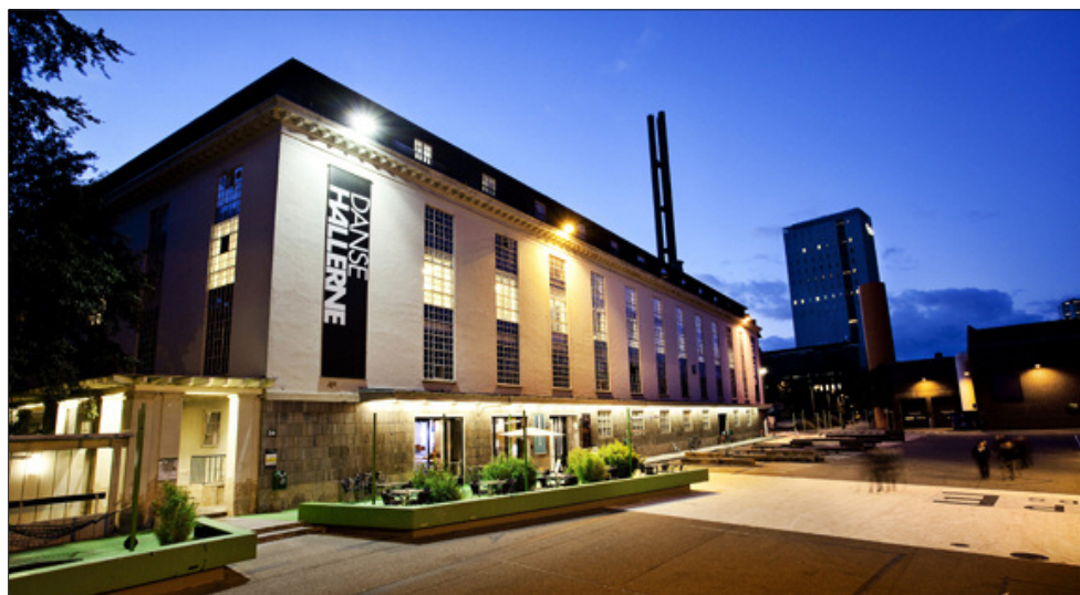
Dance Hall, venue of the EUSJA Science Debate about nanotechnology

Please mark your calendar now: June 21 to June 26, ESOF 2014 Copenhagen. EUSJA will participate with four major events.