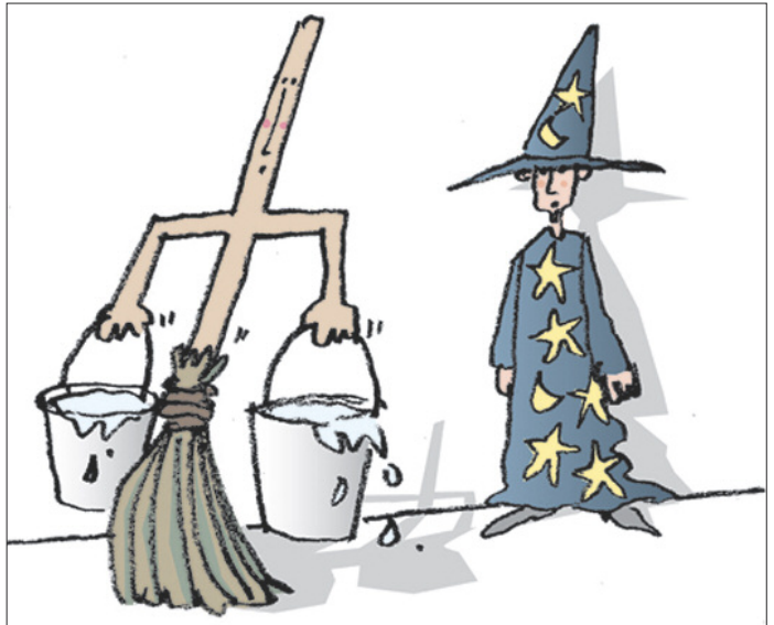
The sorcerer's apprentice

Germany's Hannovermesse is the world's leading trade fair in industrial technology. This year's event proclaimed the "4th Industrial Revolution" or "Industry 4.0". We have become used to the fact that robots have replaced muscles in factories, although while Doctor Google is increasingly consulted many of us would think twice before we would allow a robot to perform surgery.