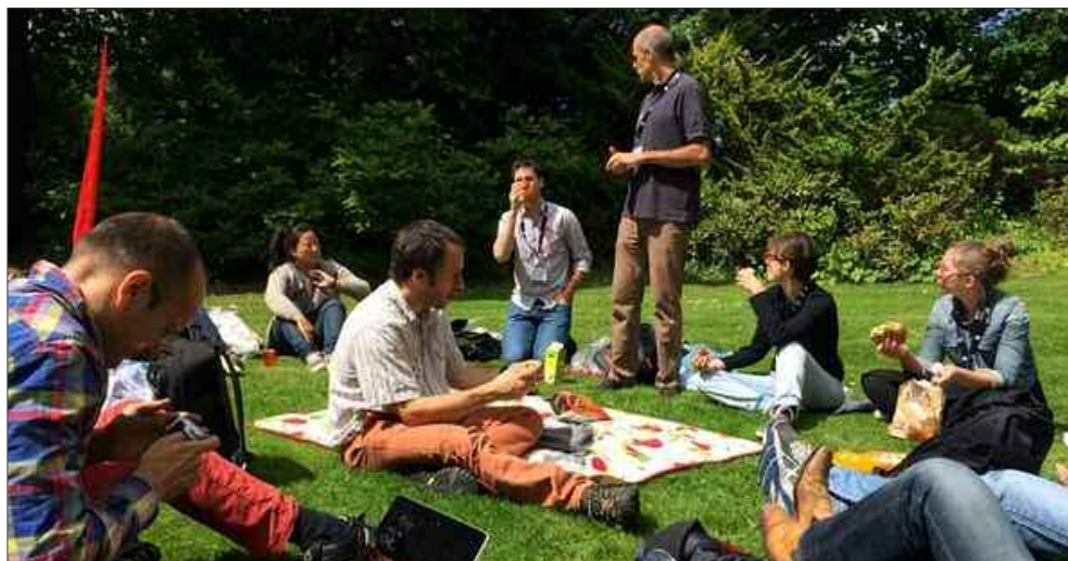
A view of the discussion at the picnic

About one year ago, I answered a call by the EUSJA board about submitting ideas for events at ESOJF 2014 in Copenhagen. The objective was enhancing science journalism and finding novel ways for facilitating discussion with fellow journalists.