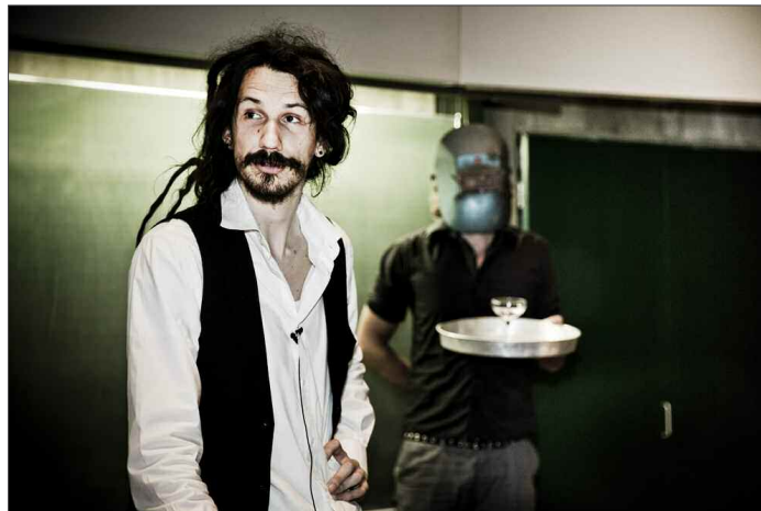
Science & cocktails

Cafés scientifiques and science slams are old news. A new format, science & cocktails, is attracting non-scientists in crowds. The synthesis of science and loose lectures, music and exotic drinks comes from Copenhagen's famous hippy district and Freetown of Christiania.