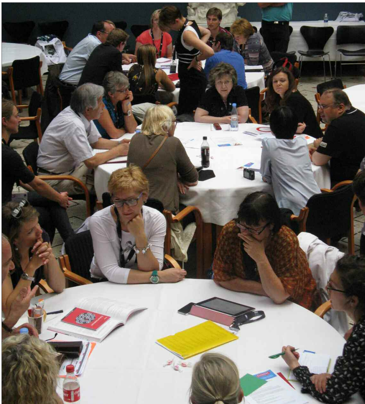
Round table discussion: 70 participants in the science debate discuss the experts' input