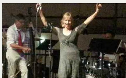
Various views of the band called 'Martha and the Cadillacs' playing at ESOF2014. The ensemble included four science journalists, two teachers, one heart surgeon and one physiotherapist