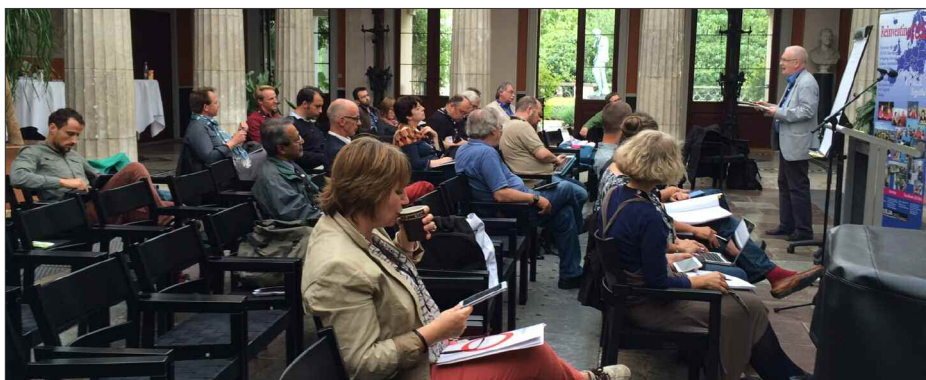
Some of the participants at the EUSJA Strategy Day

M y first half-year as EUSJA president has been full of activities. EUSJA was very visible in the European Science Open Forum (ESOF) this summer in Copenhagen. We organised the first