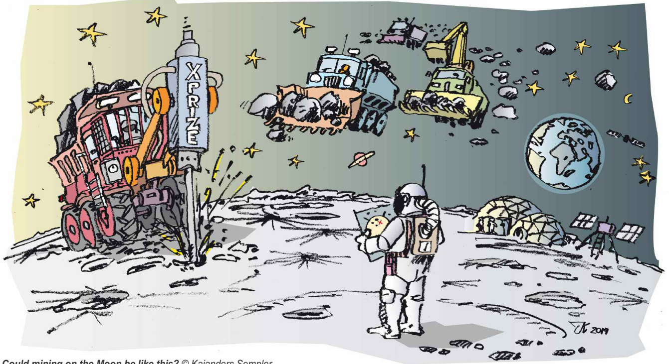
Could mining on the Moon be like this?

It is high time to plan for serious exploitation of space, according to Bernard Foing from the European Space Agency, speaking at the session 'Mining then Moon' at ESOF 2014.